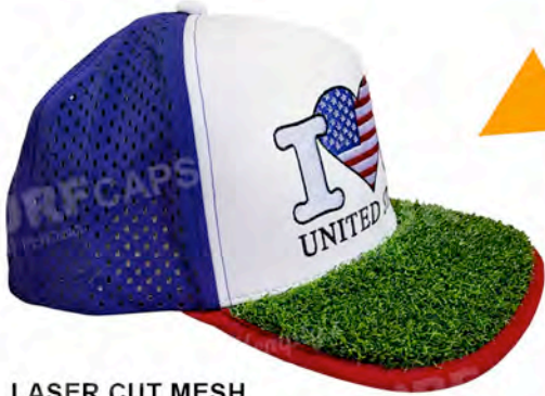
LASER CUT MESH