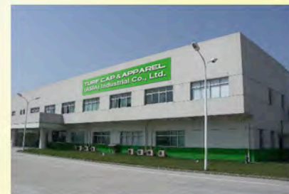
#66 Kangyuan Road, Zhujiyajiao, Qingpu District, Shanghai, China Pc: 201716