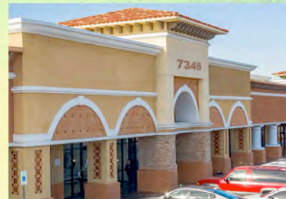
7345 S. Durango Dr., B107 #142 Las Vegas, NV, 89113, USA