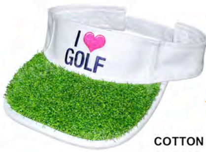
COTTON TWILL VISOR