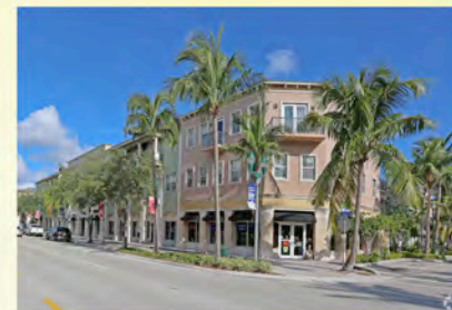
301 West Atlantic Ave. ste. 05 Delray Beach, Florida 33444